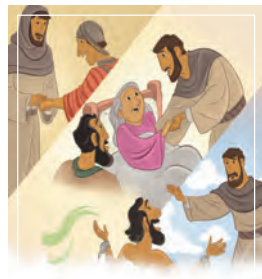
Jesus' Early Miracles Mark 1