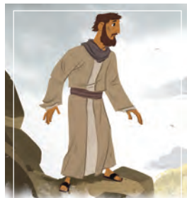
Jesus' Temptation Matthew 4; Mark 1; Luke 4