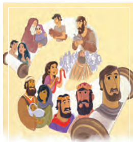
From Adam to Jesus Matthew 1; Luke 3; John 1

God's plan to save people from sin came into sharper focus as Jesus was born at last. From the beginning, Jesus proved that He is the Son of God and that all that was written about Him by the prophets was true. Jesus grew up and began to prepare for His ministry. When Jesus was baptized, God confirmed His sonship. Jesus was subsequently tempted by Satan, but He did not sin. As Jesus traveled throughout Judea, His personal encounters with ordinary people changed their lives in extraordinary ways. Jesus revealed that He was God the Son in human form, living among God's people and bringing salvation in Him alone.