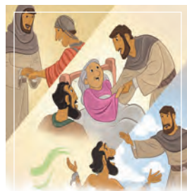
Jesus' Early Miracles Mark 1