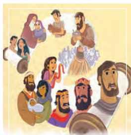
From Adam to Jesus Matthew 1; Luke 3; John 1

God's plan to save people from sin came into sharper focus as Jesus was born at last. From the beginning, Jesus proved that He is the Son of God and that all that was written about Him by the prophets was true. Jesus grew up and began to prepare for His ministry. When Jesus was baptized, God confirmed His sonship. Jesus was subsequently tempted by Satan, but He did not sin. As Jesus traveled throughout Judea, His personal encounters with ordinary people changed their lives in extraordinary ways. Jesus revealed that He was God the Son in human form, living among God's people and bringing salvation in Him alone.