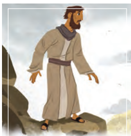
Jesus' Temptation Matthew 4; Mark 1; Luke 4